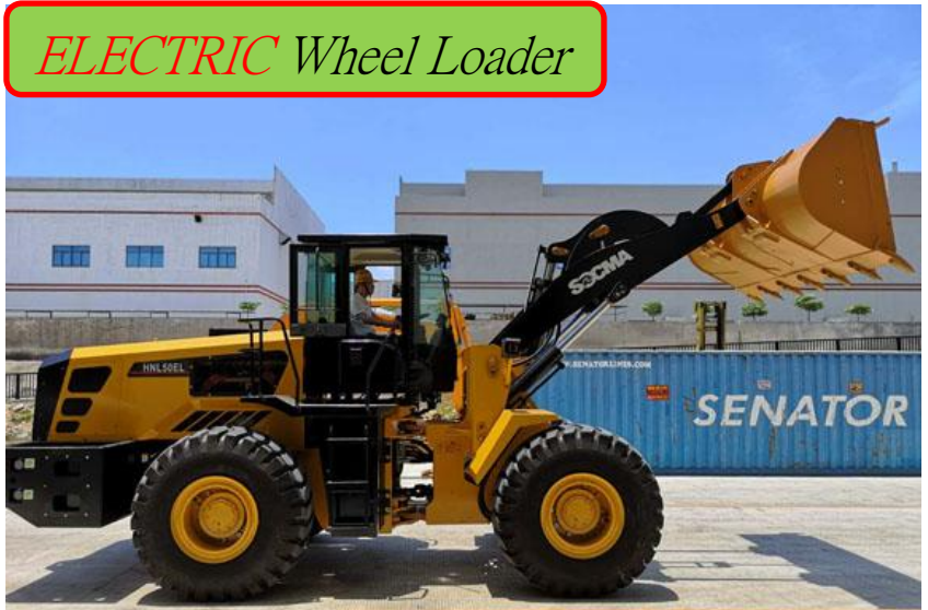
ELECTRIC Wheel Loader

Bucket capacity: ( m^3 ) 2.7-4.0 Operating weight: ( kg ) 5000 Machine weight( kg ) \approx 19200 Max. Traction Force: ( KN ) 155 \pm 3 Max. Digging force ( KN ) > 170 Overall size: (L*W *H) 8420*3000*3480 Discharge Height: ( mm ) 3062/3458 Wheel Base: 3230 Wheel Thread:( mm ) 2240 Turning Angle: ( ^\circ ) 35 Grade ability:( ^\circ ) 28